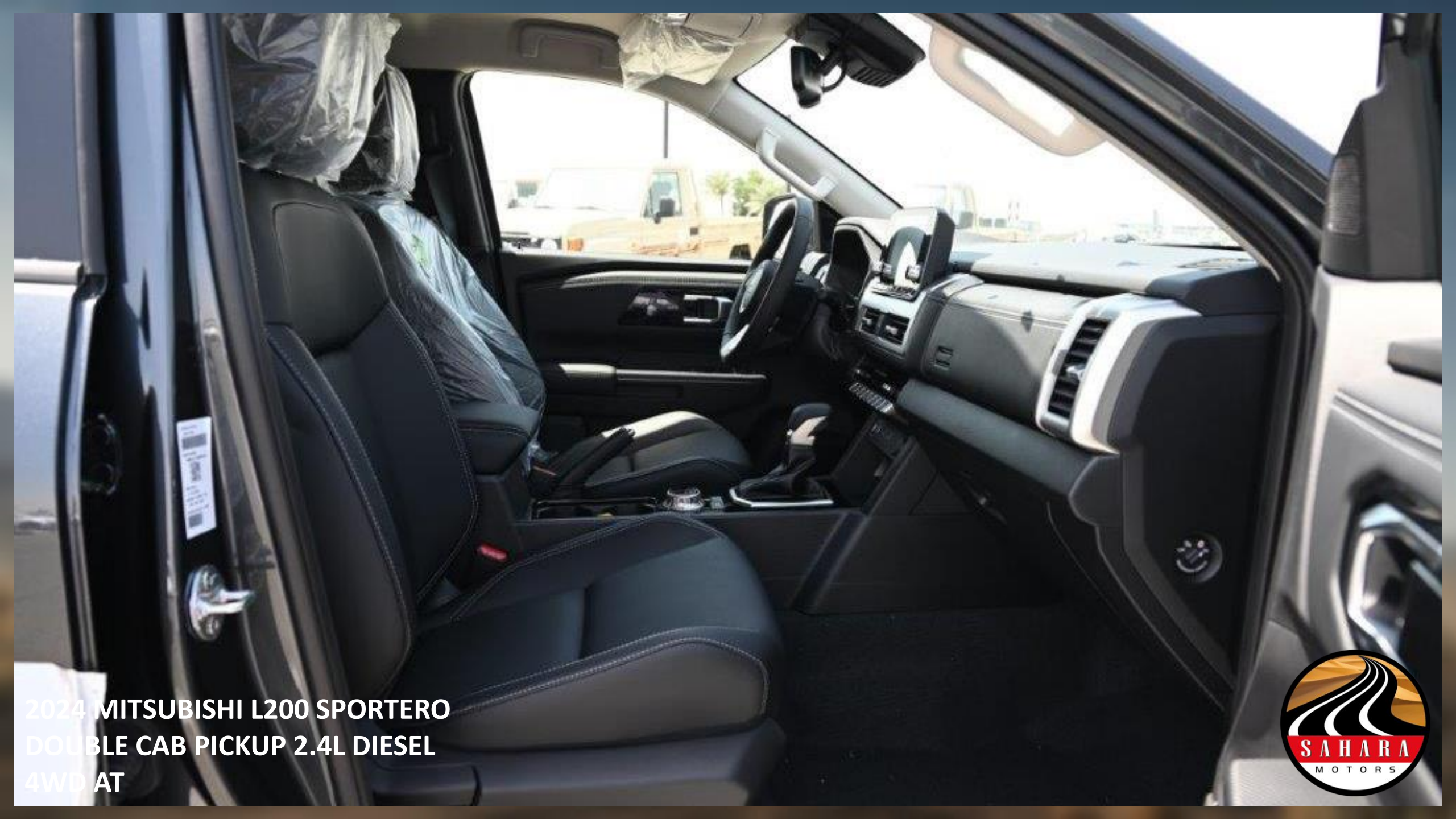
2024 MITSUBISHI L200 SPORTERO DOUBLE CAB PICKUP 2.4L DIESEL 4WD AT