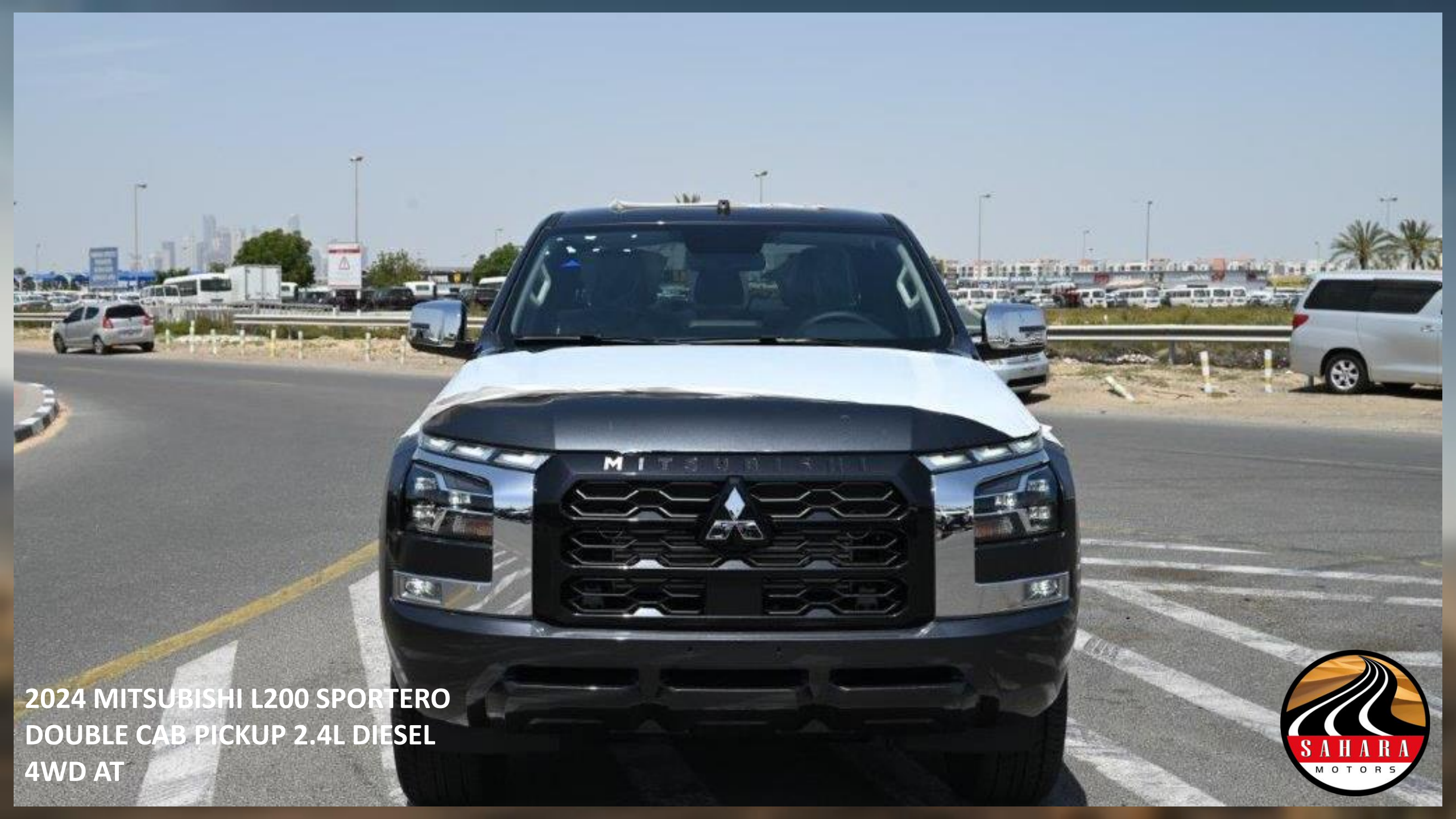
2024 MITSUBISHI L200 SPORTERO DOUBLE CAB PICKUP 2.4L DIESEL 4WD AT