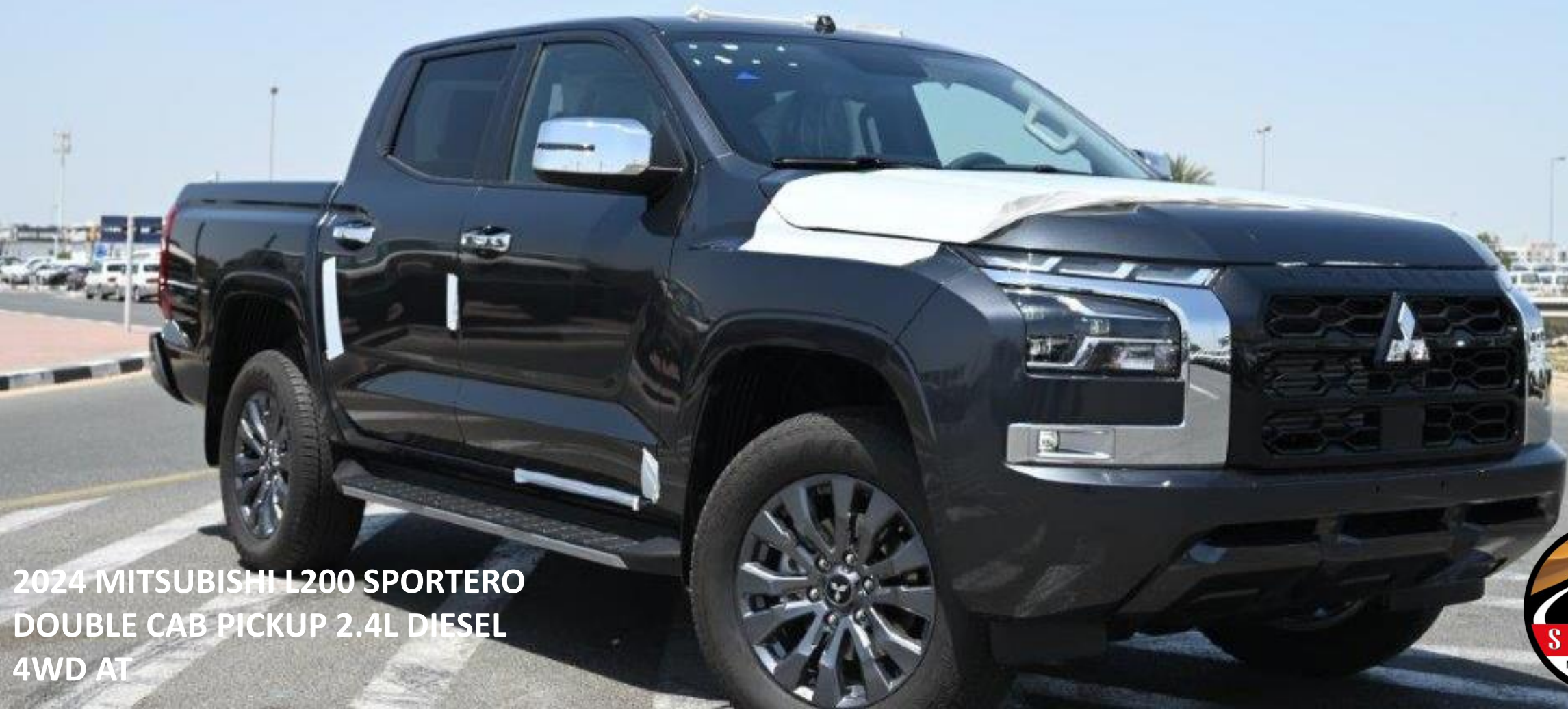
2024 MITSUBISHI L200 SPORTERO DOUBLE CAB PICKUP 2.4L DIESEL 4WD AT