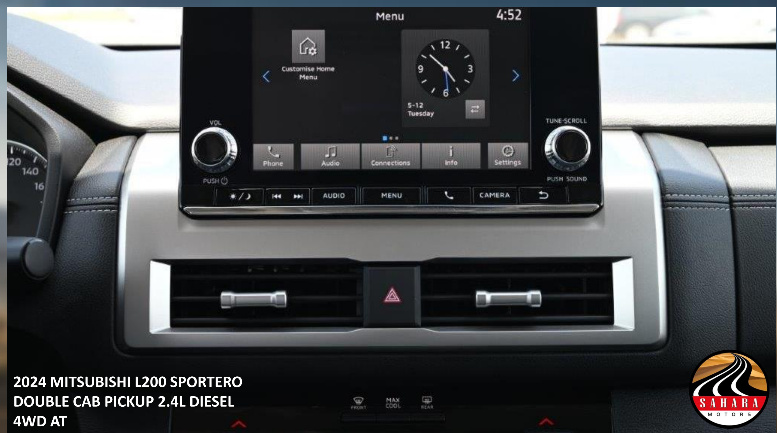
2024 MITSUBISHI L200 SPORTERO DOUBLE CAB PICKUP 2.4L DIESEL 4WD AT