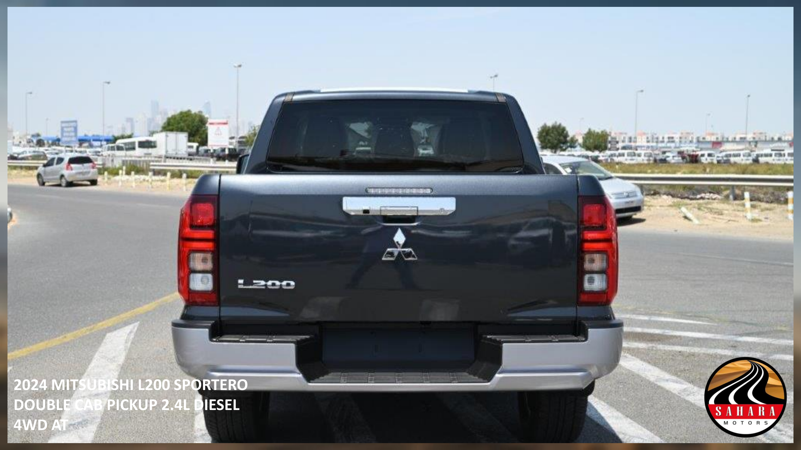
2024 MITSUBISHI L200 SPORTERO DOUBLE CAB PICKUP 2.4L DIESEL 4WD AT