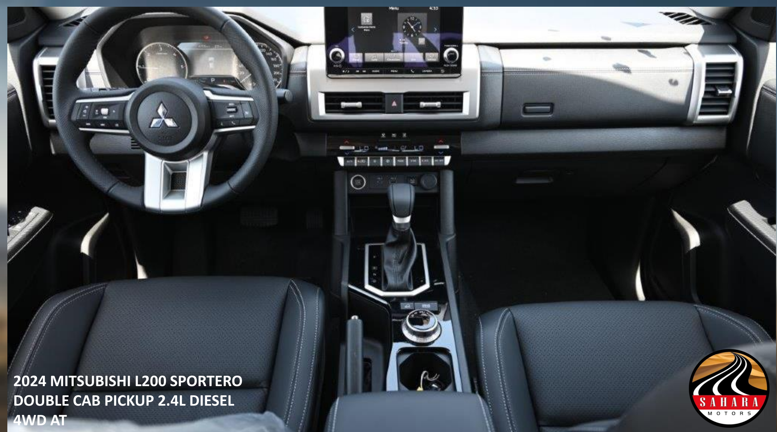
2024 MITSUBISHI L200 SPORTERO DOUBLE CAB PICKUP 2.4L DIESEL 4WD AT